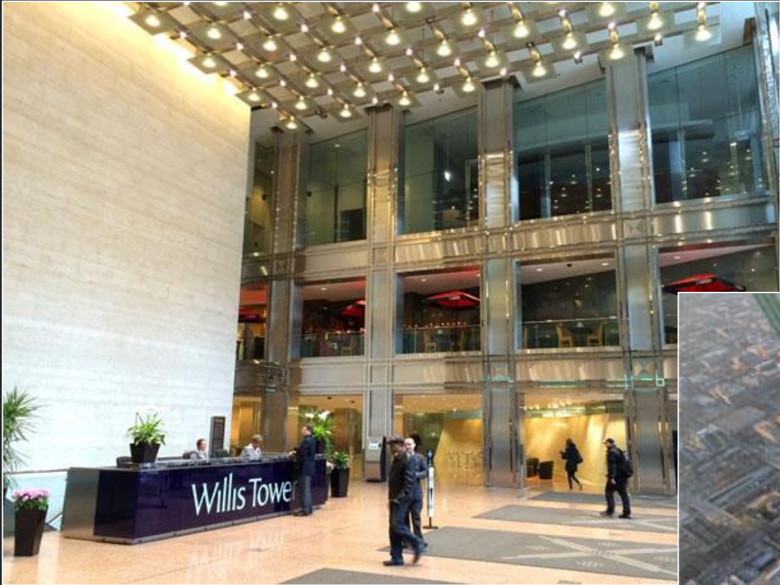
Current Office Lobby